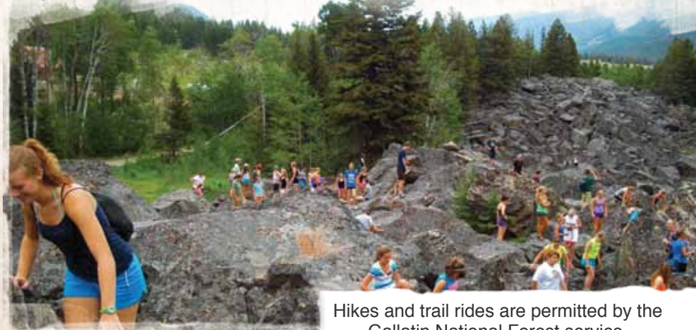
Hikes and trail rides are permitted by the Gallatin National Forest service.

Clydehurst youth camps are set up to provide an awesome opportunity for youth to get out and enjoy the beauty of the mountains in a safe environment. All the activities are closely monitored by well trained and experienced college age adults who desire to see your children grow in character, come to know Christ personally, and grow in Him. Excellent speakers challenge and encourage them in their relationship with Christ. Clydehurst is a great place for your child to meet new friends, gain new skills, and grow in their understanding of God's Word. Clydehurst runs a counselor centered program with a small camper to counselor ratio. Our staff is carefully selected with kids in mind. Give your kids an opportunity to experience a week they will never forget. Scholarships are available to those families with financial need, however, because funds are limited, we do ask that you seek help from your home church or extended family first.